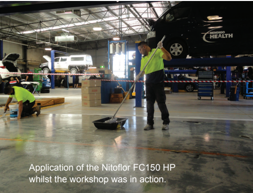
Application of the Nitoflor FC150 HP whilst the workshop was in action.