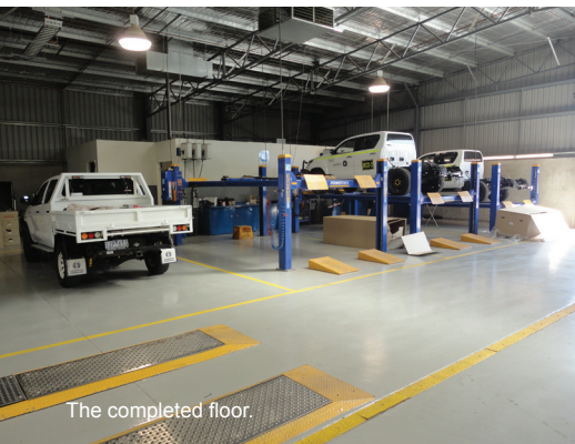
The completed floor.